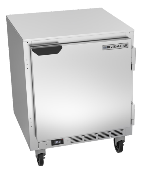
*Note: Shown with optional full electronic control